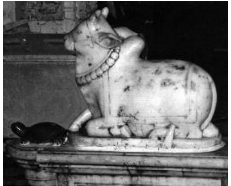
Fig. 5 Kūrma in front of Nandi. Babulnatha temple, Mumbai.