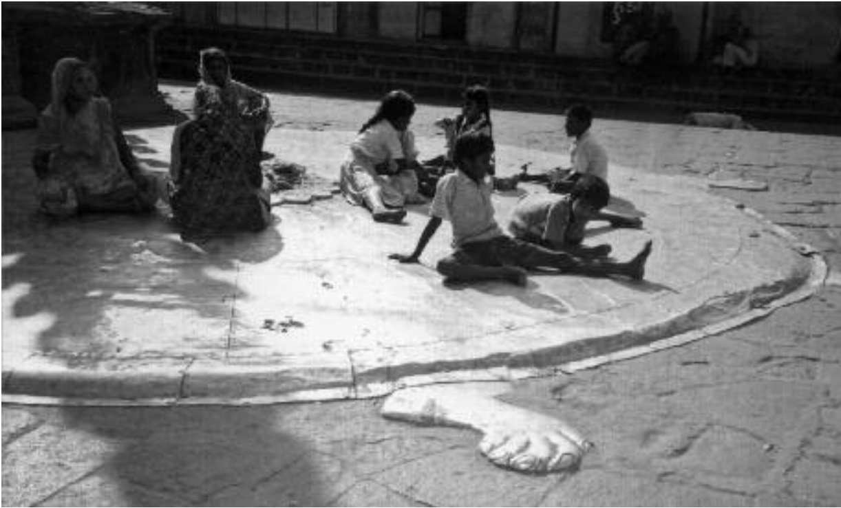
Fig. 13 Devotees seated on the back of the large brass turtle in front of the Khaṇḍobā temple, Jejuri.