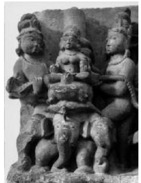
Fig. 8 Viṣṇu's Kūrma avatāra on a lintel, 10th century. Archaeological Museum, Khajuraho.