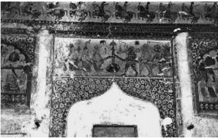
Fig. 10 Churning of the Ocean painted on a door, 17th century. Orchha.