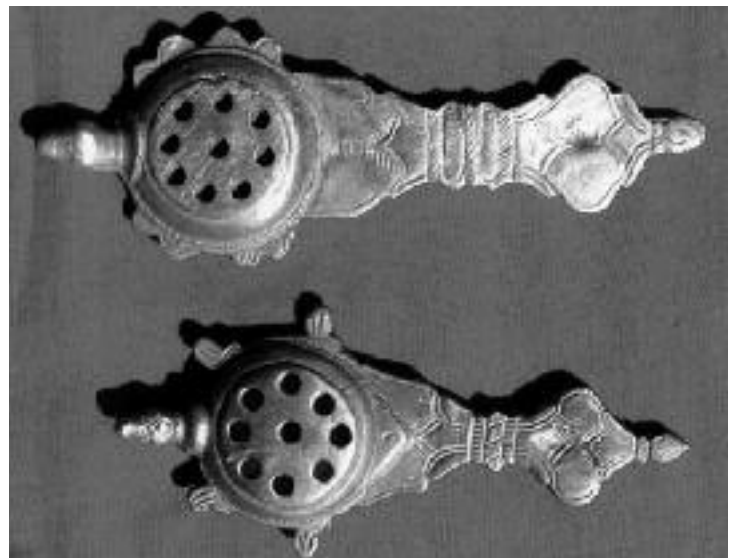
Fig. 3 Lamps for āraṭi .