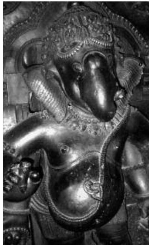
Fig. 15 Gaṇeśa from Orissa wearing tortoise amulets. The British Museum, London.