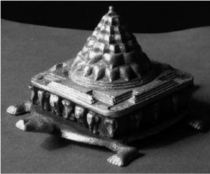
Fig. 4 Meru Yantra supported on the back of a tortoise.