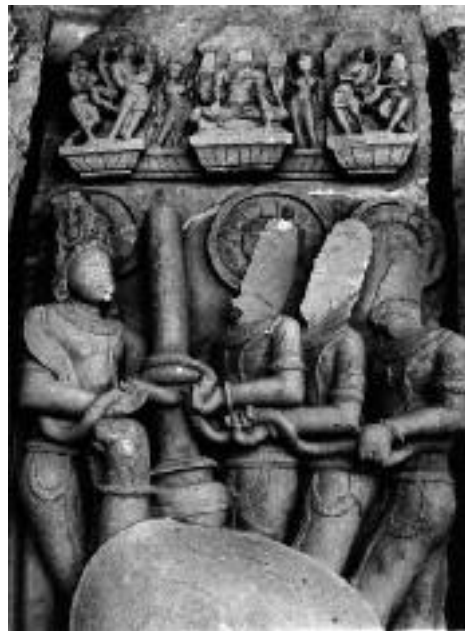
Fig. 7 Viṣṇu's Kūrma avatāra – Churning of the Ocean, Gadhwa, Uttar Pradesh, c. 9th century.