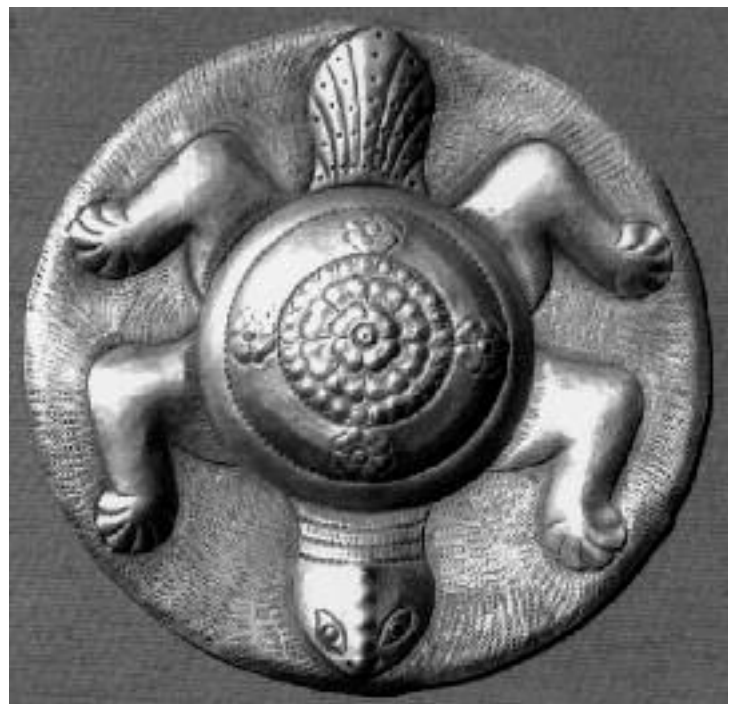
Fig. 12 Brass turtle with a lotus embossed in the centre of its back. Kolhapur.