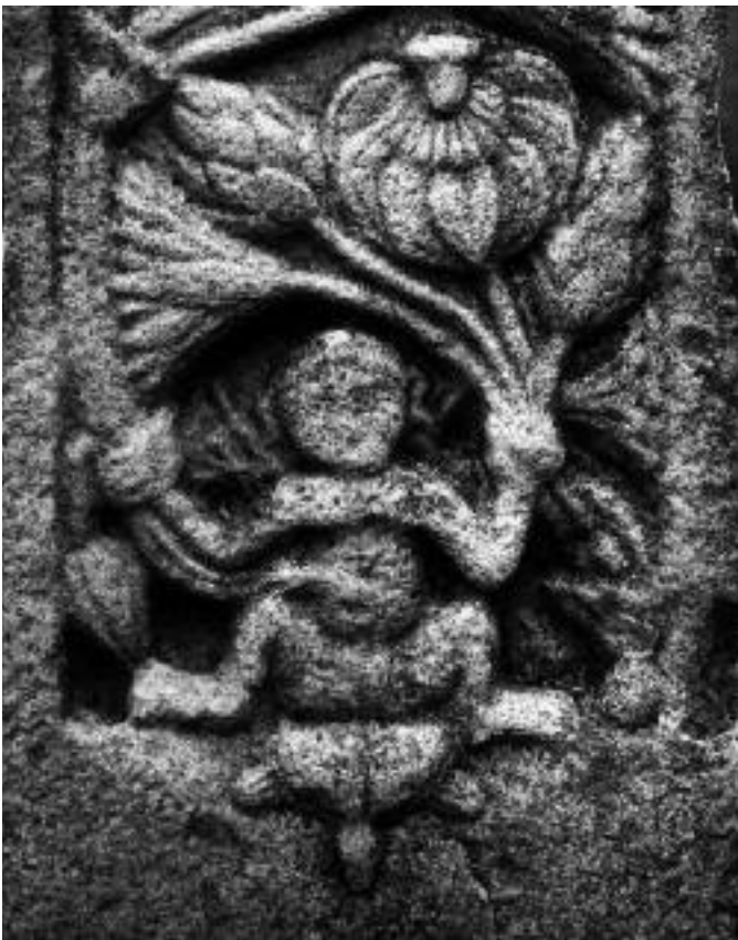
Fig. 14 A female figure, possibly the Earth Goddess, seated on a tortoise, Sanchi Stūpa II, c. 2nd century BCE.