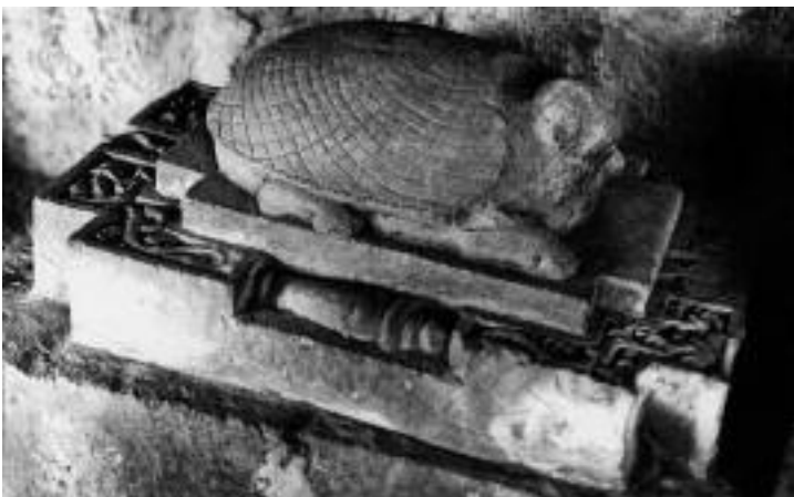
Fig. 11 Kūrma avatāra with a perforation on its back, 11th century. Markandi.