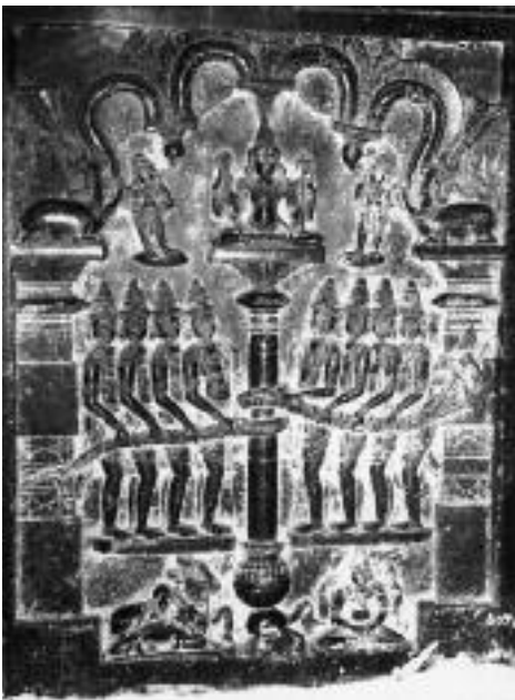
Fig. 6 Churning of the Ocean pillar from Andhra Pradesh. State Archaeology Museum, Hyderabad.