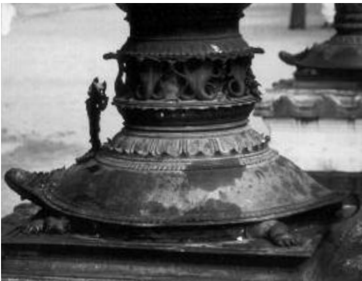
Fig. 2 A tortoise as support for a lamp-stand ( dīpa-stambha ) in a temple courtyard, Kerala.